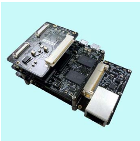
External appearance of iSPF-100

Shikino, as applied business areas of iSPF-100, focuses on the fields of factory automation (i.e., robots, inspection devices and so on) and social infrastructure. Also, it expects market demands of iSPF-100 for stereo cameras and network camera systems greatly requested by customers, and aims to achieve two (2) billion JPY as sales of the whole video-related business including this solution after three (3) years.